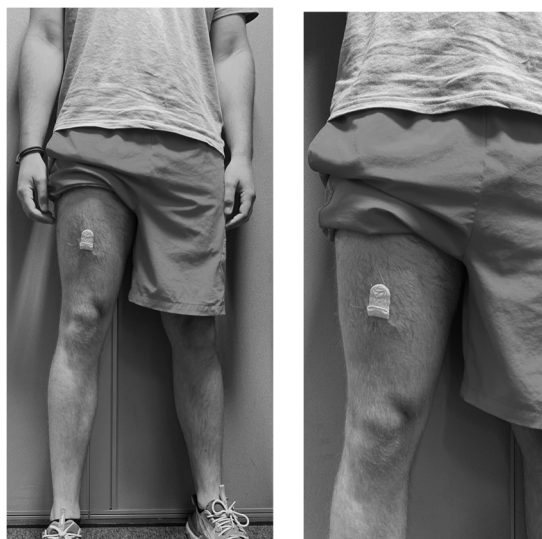
Figure 2. activPAL3 fitting and placement on the participants' midline of the anterior aspect of their right thigh, using a nitrile sleeve and waterproof Tegaderm.

On Sundays, participants were instructed to remove the activPAL3 and connect it to a PC via a USB interface. The participants were provided with a link to download PALtransfer, a proprietary software. PALtransfer enabled participants to upload their activPAL data file to the PALportal (an online cloud storage facility), charge the activPAL3, and begin a new recording for the week ahead. Participants were instructed to refit the activPAL3 before going to sleep on Sunday evening.