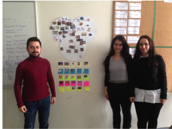
Fig. 3. Testing how Storycraft resonates with software developers while conducting a Scrumban process with support from Storyply.

The team used Scrumban, which is a combination of Kanban and Scrum, in their development process. We added two phases from the Backstage of Storyply, i.e., Insporation and Categorizing Story Elements, as well as a condensed version of the On-Stage phase. We were interested in observing the effects of the Storyply activities on the Scrumban methodology and on the team process and outcomes. Our preliminary results indicate the effectiveness of the proposed approach in several respects. Firstly, it helped the development team to build a shared metaphor. Secondly, the visual progress in the development phase was visible to all team members so that it could be used as a reference in the discussions. Thirdly, this approach helped the team to reveal already at an early stage the potential problems that needed to be resolved in the software development process.