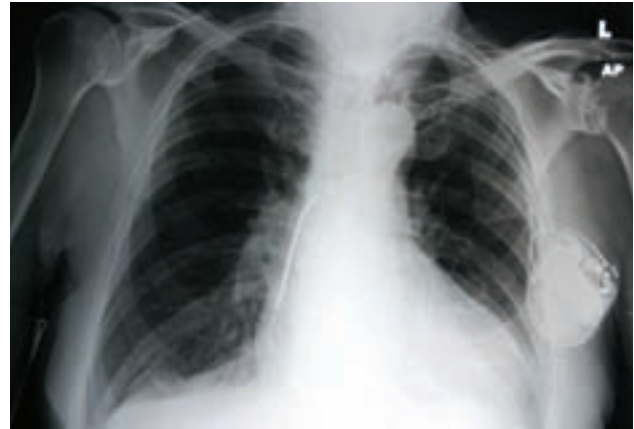
Almost 60% of survey respondents had suffered lower back symptoms as a result of their work as veterinary practitioners.

Accurate risk identification and assessment are the cornerstones of occupational health and safety, and necessary first steps in the development and prioritisation