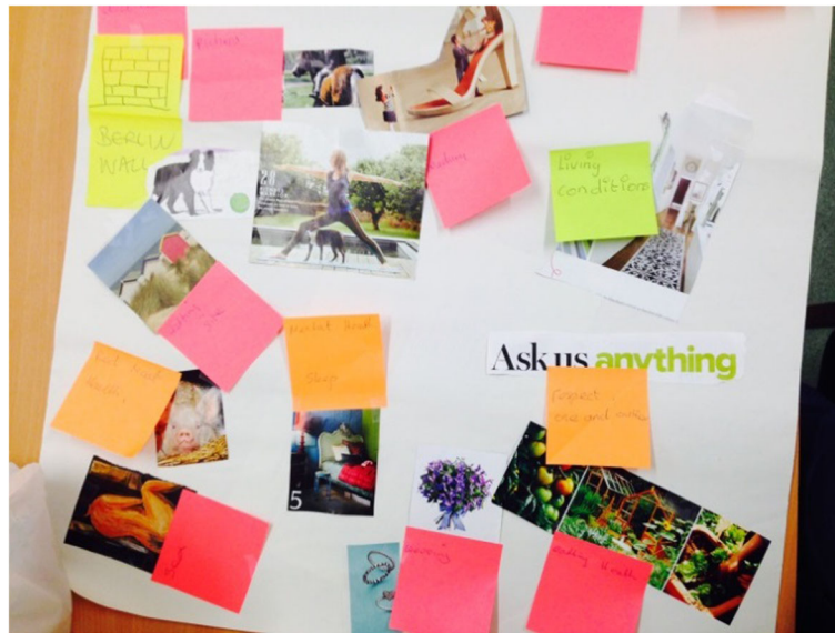
Fig. 1 PLA chart after flexible brainstorming

to the research sessions [73]. The core research team met regularly to discuss the work, with research notes, transcripts and reflective debriefing notes being circulated and discussed. Designated research data analysis sessions took place to discuss emerging findings across the six marginalised groups.