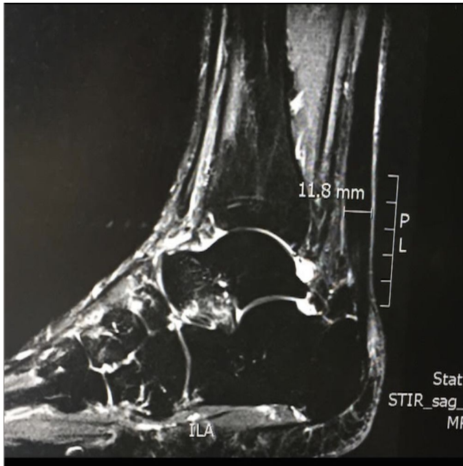
Figure 1 Sagittal view MRI showing Achilles tendon thickness of 11.8mm.

Physical examination showed thickening of the midportion of the Achilles tendon bilaterally with pain on palpation and during a single leg heel raise.