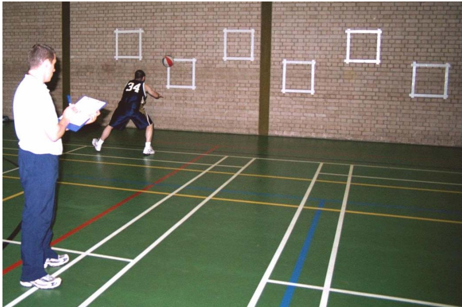
Figure 4. Participant Performing the AAHPERD (1984) Basketball Passing Test (Photographer: Ali Maghoo).

The test score was obtained by totalling all the points scored over the duration of the thirty-second test.