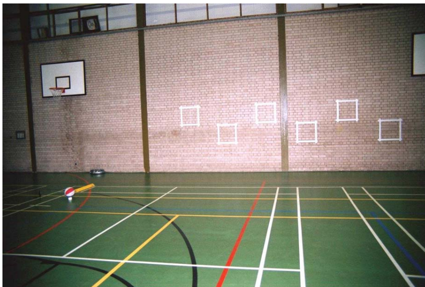
Figure 3. Set-up of the AAHPERD Basketball Passing Test.