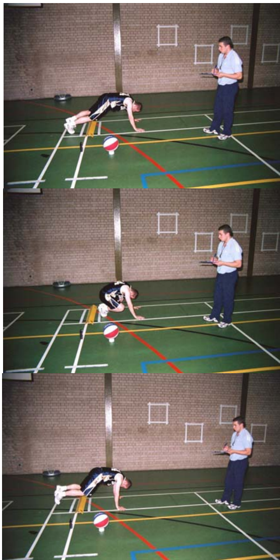
Figure 1. Participant performing squat thrusts.

different team sports at collegiate level. Their mean age, height and weight were: 23.30 \pm 1.05 yrs, 1.76 \pm 0.03 m, and 80.50 \pm 5.64 kg respectively. Ten expert basketball players also participated in the study and consisted of a mixture of national division one and two players. Their mean age, height and weight were: 22.50 \pm 0.41 yrs, 1.83 \pm 0.20 m, and 87.80 \pm 4.02 kg respectively. Following institutional ethics approval, informed consent was provided by each participant after being fully informed of the nature and demands of the study.