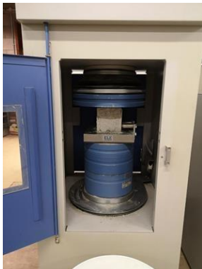
Figure 1. Crushing concrete cubes for compressive strength tests

both seven days and twenty-eight days from each of the eight cement mixes are developed, which will be made up of a 10% GGBS and 90% OPC cement mix and increasing the percentage proportion of GGBS and decreasing the percentage proportion of OPC by 10% up to a maximum of 70% GGBS and 30 % OPC, as well as an eighth control mix of 100% OPC to compare results. Compressive strength tests are conducted by crushing the concrete once the cubes have cured for the allocated time. All of the mixes are composed of the listed proportions of GGBS and OPC, whilst the quantity of stones, sand and water content will remain uniform among all mixes to avoid any unequal results based on extenuating factors such as water retention ability. Figure 1 illustrates the concrete cubes being crushed for compressive strength tests.