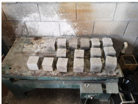
Figure 4. Concrete cubes air curing in laboratory