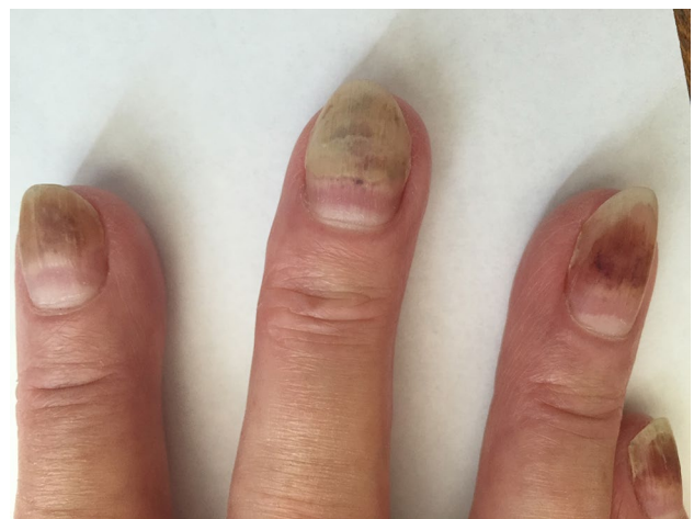
Image 3 Painful chemotherapy induced parial onycholysis

The plant-based waxes and essential oils selected for this study are naturally rich in phytochemicals, especially the phenolic polyphenols group which are reported to have anti-oxidant, anti-inflammatory, DNA repair enhancing and anti-microbial properties [10–17]. In addition to their abilities to moisturise the skin, preventing drying and the splitting of nails, it was hypothesised, they would be sufficiently absorbed into the nail beds to act as a local antidote to the chemotherapy, preventing damage to the proliferating stem