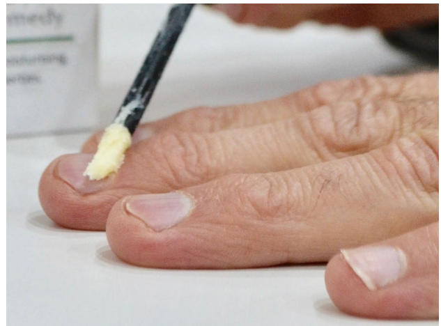
Image 5 Polybalm applied to cuticles, surrounding skin and nail beds on the fingers preserving nail health