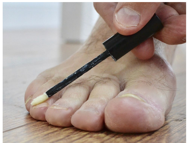
Image 6 Polybalm applied to cuticles of toe nails

and smell. Participants were shown how to apply their allocated balm to their finger nail beds, 2–3 times a day, until the end of their chemotherapy (Images 5, 6). No members of the research team, physicians, participants or the statistician were aware of the contents of either balm pot until the final results were analysed.