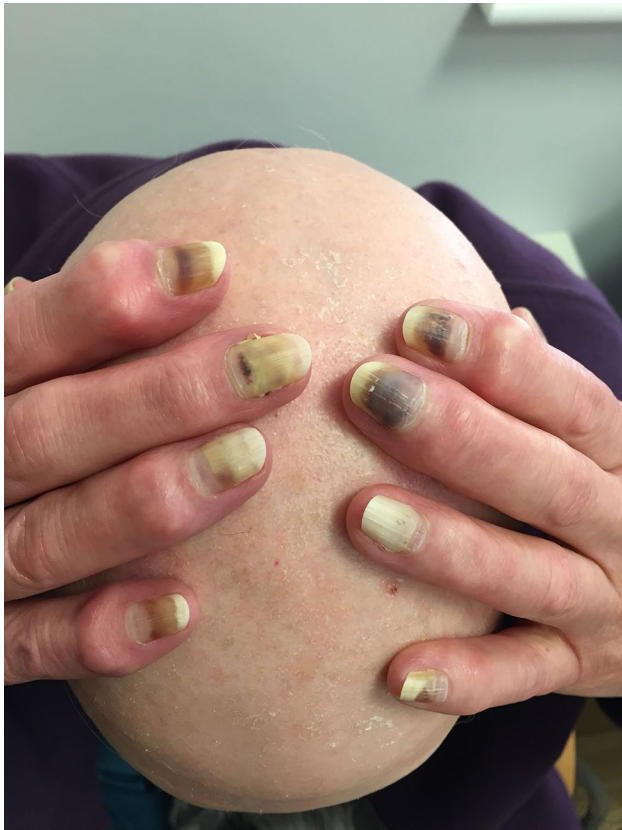
Image 4 Severe, distressing subungual haemorrhages and secondary infection leading to complete onycholysis

cells as well as avoiding secondary damage from inflammation or secondary infection [10–19].