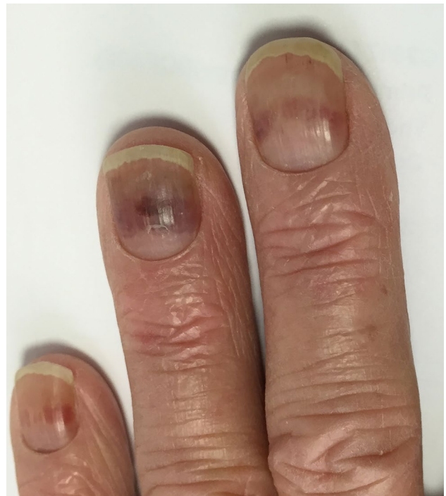
Image 2 Uncomfortable, chemotherapy induced subungual haemorrhages

The plant-based waxes and essential oils selected for this study are naturally rich in phytochemicals, especially the phenolic polyphenols group which are reported to have anti-oxidant, anti-inflammatory, DNA repair enhancing and anti-microbial properties [10–17]. In addition to their abilities to moisturise the skin, preventing drying and the splitting of nails, it was hypothesised, they would be sufficiently absorbed into the nail beds to act as a local antidote to the chemotherapy, preventing damage to the proliferating stem