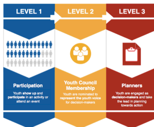
Spectrum of Cree Youth Engagement