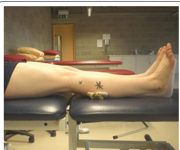
Figure 1 Scanning position. Test position with star indicating point of measurement. The lateral malleolus and head of fibula can also be seen marked with an 'x'.

A Esaote Aquila ultrasound scanner (Pie Medical, Maastricht, The Netherlands) with an 8 MHz linear array transducer (Esaote Europe, The Netherlands; 40 mm footprint) was used for measuring both the left and right anterior tibial muscle groups. Measurements were taken in both transverse and longitudinal directions. The testing positioning and procedure used was based on previous research measuring anterior tibial muscle size using real-time ultrasound imaging [7]. Subjects were positioned in long sitting on a plinth, with the hip in 90 degrees flexion, the knee extended and the ankle resting in zero degrees in an ankle foot orthosis (AFO). The subjects wore shorts in order to leave the lower limbs exposed. Scans were taken at a point 20% of the distance from the head of fibula to the tip of the lateral malleolus. The distance was measured using a measuring tape. This point was then marked on the subject's leg (Figure 1).