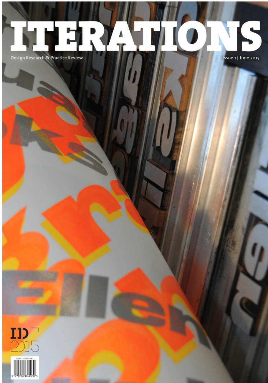
Fig 1: ITERATIONS First Issue, Published June 2015

ITERATIONS (Fig 1) was formally launched in June 2015 in conjunction with another initiative of ID2015, the first Irish design research conference entitled Faultlines- Bridging Knowledge Spaces . The review was very well received with 500 print copies of the first issue released for sale and distribution over the following weeks and months. The interest from the design community reinforced the need for such a platform and this was backed up by offers of follow on long term funding from the board of the IDI, extra seed funding from ID2015 and institutional subscription. At the time of writing this paper the second issue (Fig 2) has again received widespread interest and the third issue has called for submissions. The developments to date ensure that the review has a sustainable open access model which