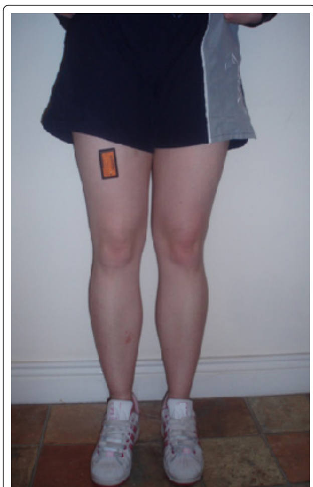
Figure 1 ActivPAL placement.

available for the Actigraph, was needed. As time spent sitting/lying can produce counts (for example when fidgeting or when moving lightly while sleeping) it was decided that extended periods of continuous zero counts produced while in the posture of sitting/lying would reflect non-wear time. Therefore, non-wear time was defined as 60 minutes or more of continuous unbroken 0 counts from the output data file. When this time was identified, it was omitted and the 24-hour day adjusted accordingly. Total hours spent sitting/lying and standing over the full 24-hour monitoring period was summed directly from the ActivPAL daily and weekly output for each participant. Sedentary levels were also expressed as the total and percent amount of time spent sedentary during the full 24 hours (which included time spent lying while sleeping).