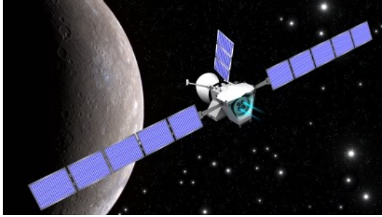
Figure 1. BepiColombo Arriving at Mercury [7]

BepiColombo will perform a series of scientific experiments, tests and measures. For example, BepiColombo will make a complete map of Mercury at different wavelengths. Such a map, will chart the planet's mineralogy and elemental composition. Other experiments will be to determine whether the interior of the planet is molten or not and to investigate the extent and origin of Mercury's magnetic field.