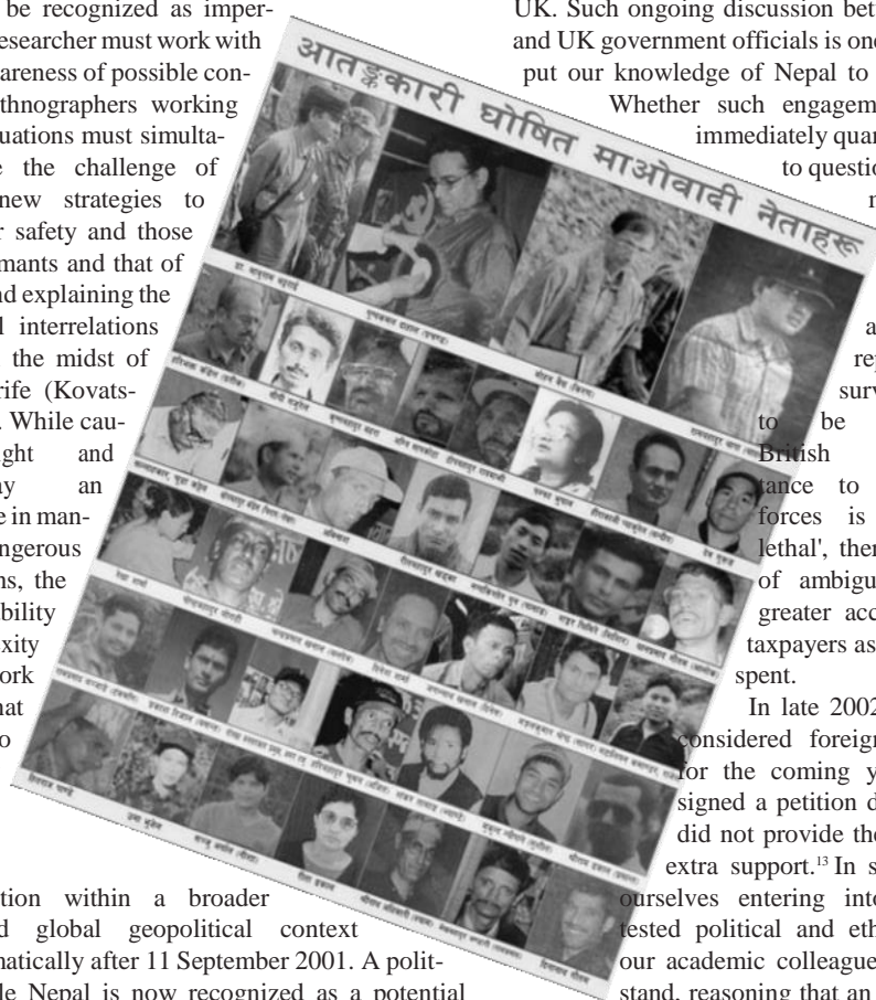
Fig. 8. A poster widely distributed in Nepal in 2002, showing Maoist leaders declared terrorists'. The government offered cash rewards for information leading to their capture.

In late 2002, as the US Congress considered foreign military allocations for the coming year, all three of us signed a petition demanding that the US did not provide the Nepali military with extra support. 13 In signing this, we found ourselves entering into increasingly contested political and ethical waters. Some of our academic colleagues were critical of this stand, reasoning that an ostensibly democratic regime had the right to defend itself against armed insurgents. Some Nepali colleagues felt that this petition