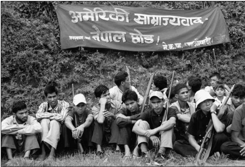
Fig. 9. Maoist fighters as part of the audience at a cultural programme. The banner in the background says, 'American imperialism - quit Nepal'. Surkhet district, June 2003.