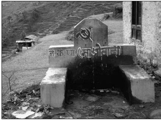
Fig. 5. Water tap in a rural area of Nepal inscribed with graffiti reading 'Communist Party of Nepal (Maoist)'.