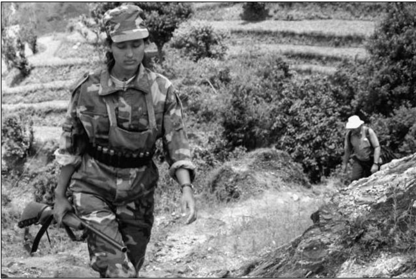
Fig. 7. A Maoist woman fighter in combat fatigues walks up a hillside path.

ference on the Maoist movement in the autumn of 2001, as I felt that inadequate attention was being paid to the impact of the conflict on the people being most affected by it - rural civilians.