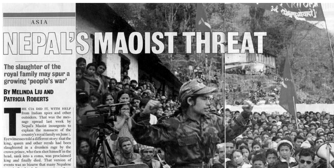
Fig. 1. Newsweek magazine covers the Maoist insurgency.