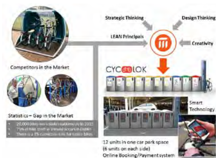
Dolmen's process applied to Cyc-Lok

generation and evaluation of new business concepts was required.