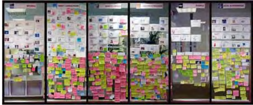
Generating Solutions Wall