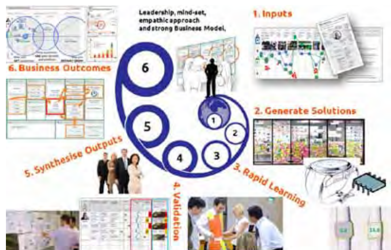
Dolmen's Discovery Stage