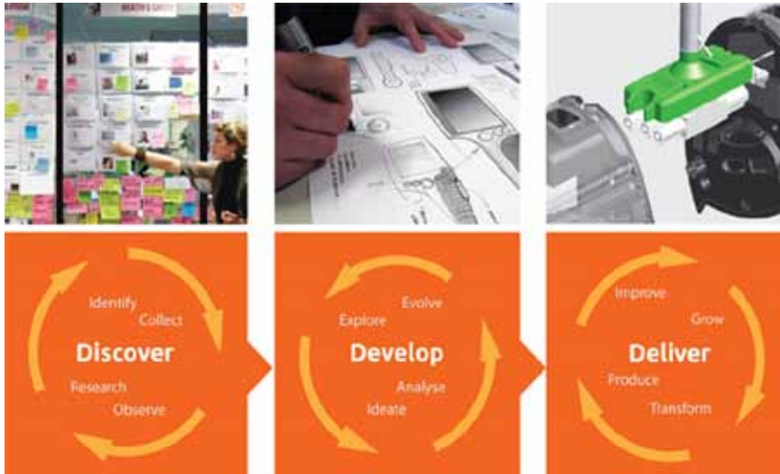
Dolmen's Strategic Design Thinking Process

Strategic Thinking begins when business goals are set and it becomes clear that a more desirable outcome is required over the current business norms. These can be around the business model; financial, new revenue streams, exploring new routes to market, new combination of partnerships and collaborations, and using new technologies and platforms to transform or change how the business operates, delivers and creates value. This also includes the level of innovation aimed for by the company.