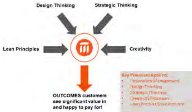
Dolmen's Key Ingredients

In this paper the primary focus is on the Discovery stage of the process, that early stage that really digs deep into the unmet and unarticulated needs of the end user. Ideation and structured creative techniques are used to generate new ideas in a measurable business outcome focused manner. The Dolmen process is illustrated via case study discussion and focusing in on the 'job to be done' in a highly practical manner.