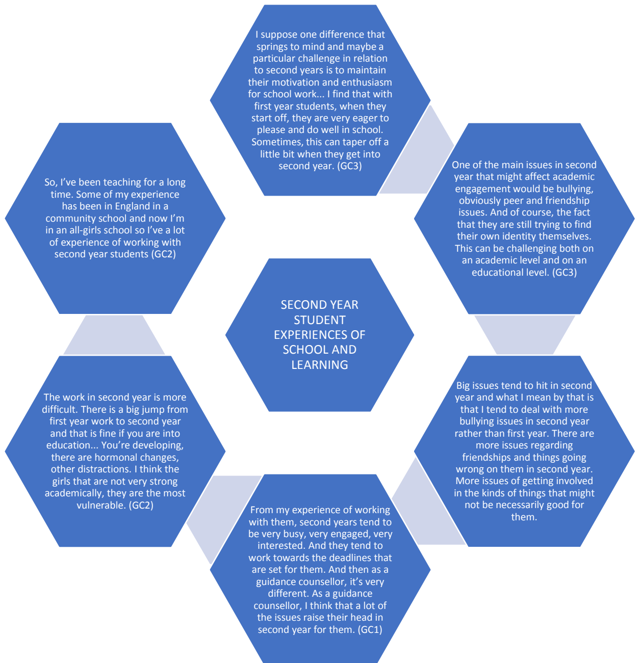
FIGURE 4.3 QUOTATION BANK SHOWING GUIDANCE COUNSELLORS PERSPECTIVES ON SECOND YEAR STUDENTS AND SECOND YEAR STUDNETS' EXPERIENCES OF SCHOOL AND LEARNING DURING SECOND YEAR.