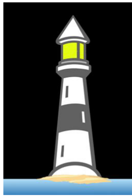
Figure 2 The Lighthouse test.

One important implication of this study is that formal testing using any conventional test can assist delirium detection – all tests were quite sensitive to the presence of delirium but the Vigilance A and B and the MBT were the best individual tests in terms of overall accuracy. This is in keeping with previous studies that have included direct comparisons of cognitive tests in the identification of delirium in elderly general hospital inpatients and which have consistently found that bedside tests of attention (including sustained or vigilant attention) are sensitive to the presence of delirium, with the Months Backward Test emerging as the most versatile individual test [10,29-33] .